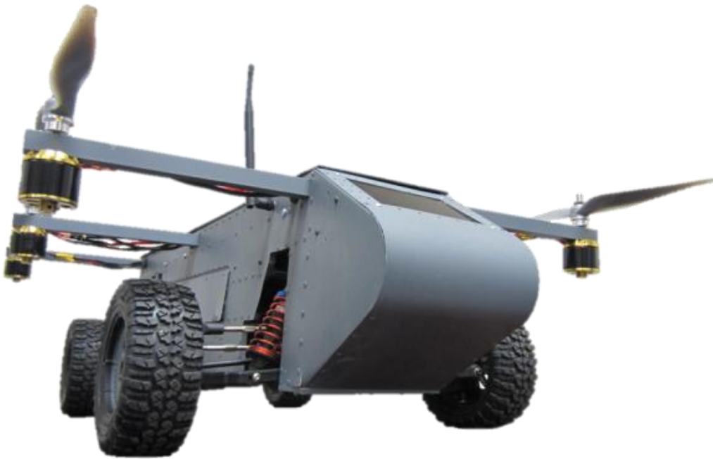
Figure 1: Currently available for sale, the new Autonomous AT Panther Air/Ground Robot sUAS is the world's first air- and ground-mobile surveillance and package delivery robot

TORRANCE, California, 10 November 2016 – Don Shaw, CEO of Advanced Tactics Inc. (AT), a research and rapid development company in Southern California, today announced that AT has begun production of a new type of autonomous drone system for surveillance and package delivery that can drive like a car and fly like a helicopter – the Autonomous AT Panther Air/Ground Robot.