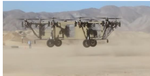
Figure 4: Black Knight Transformer Flying

Now, Advanced Tactics has successfully miniaturized and developed its proprietary technologies to create the new Autonomous AT Panther Air/Ground Robot for commercial and consumer use. AT is interested in partnering with package delivery companies and private distributors.