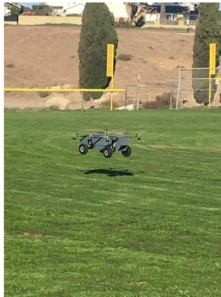
Figure 3: AT Panther in VTOL hover mode