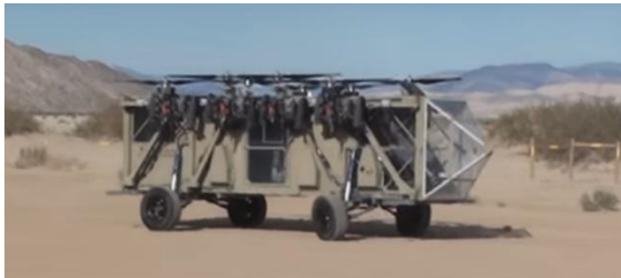
Figure 5: Black Knight Transformer Driving

AT previously developed the Black Knight Transformer, demonstrating its patented air/ground mobility technologies on a 2-ton manned or unmanned air/ground vehicle with VTOL flight and off-road driving capabilities designed for casualty evacuation.