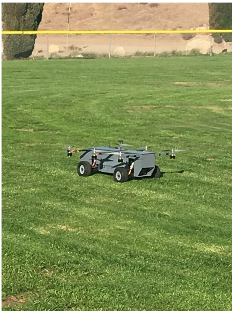
Figure 2: AT Panther in driving mode

The new Autonomous AT Panther Air/Ground Robot sUAS is now in production for commercial sale, and is being offered at an attractive introductory price so that even the general public can now own this unique vehicle.